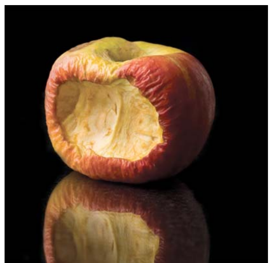
ANDREAS SÖDERBERG ECOLOGICAL APPLE video