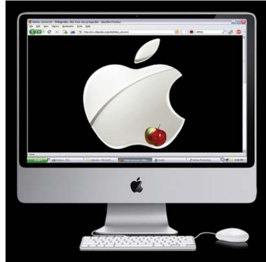
MARTIN GANTMAN BIG APPLE / FALLEN APPLE

Forty-eight artists have been invited to exhibit responses to IMAGING THE APPLE.