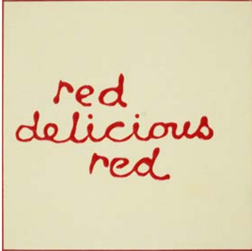
JANENNE EATON RED DELICIOUS RED